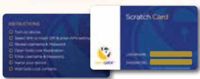
USER ID SCRATCH CARD